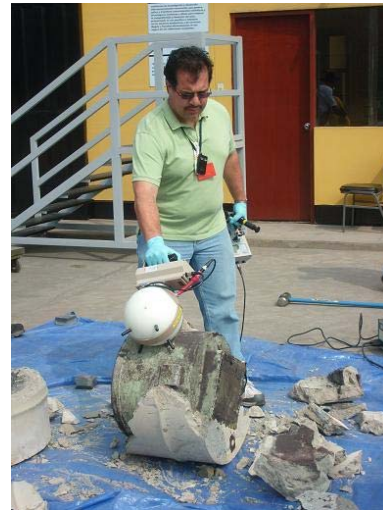
Figure 3. Measurement of dose-rate.

– Radiological Monitoring: Radiological surveys, beta/gamma/neutron area survey and contamination checks in work areas, were conducted by radiological protection personnel from both teams before, during, and after each work day. Radiological protection personnel identified sources of radiation and designated low dose, safe waiting areas. During source/device identification and packaging radiological protection personnel monitored the process to help personnel minimize radiation dose received. See calibrated radiation protection equipment used which was provided by the LANL team (Figure 3).