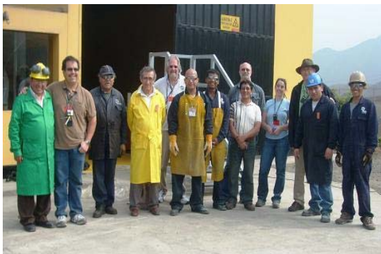
Figure 2. IPEN and LANL working groups.