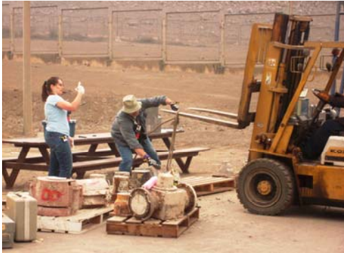
Figure 4. Removal of disused sealed sources.