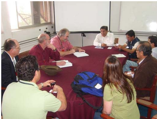
Figure 1. Coordinated work between IPEN and LANL teams.

As part of the joint work plan, a pre-work meeting was conducted to ensure both teams understood the safety and technical aspects of the work to be conducted. Also, daily meetings were held in order to discuss the work expected to be completed during that day and review previously conducted work to see what improvements could be made to prepare for activities. Both technical teams developed activities according to the joint program needs (1). See Figures 1 and 2.